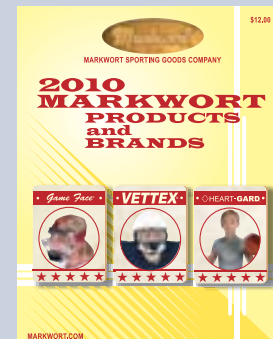
Markwort Products & Brands $12.00 EA 2010M September 2009 92 Pages