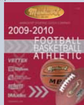
2009 Football Basketball Athletic $12.00 EA 2010FKA July 2009 104 Pages

All active accounts will be mailed one copy of each new catalog as it becomes available. Orders for additional catalogs will be charged the prices shown less your appropriate dealer discount. Prices shown are suggested retail list price.