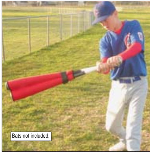
Bats not included.

Perfect For Warm-Up During The Game And Building Hitting Skills