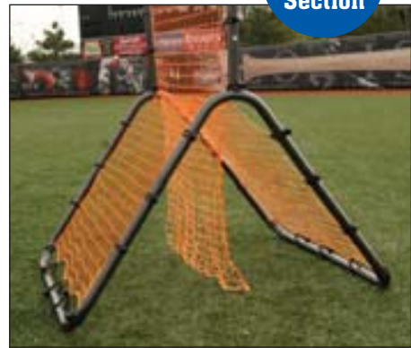
PRPRO Bonus net section.