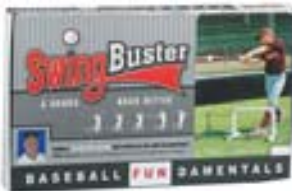
Retail Package HBH-TEAM