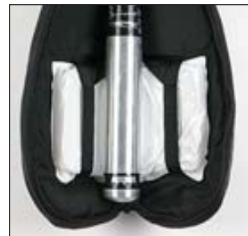
Close-up view of Microcore ® pack inside Bat Warmer