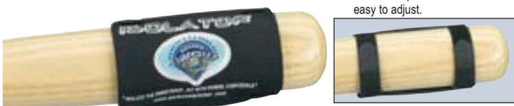
Hook 'n loop fasteners make it easy to adjust.

For baseball and softball bats. Keeps bats looking like new while bat is not in use. Attaches easily to all sizes of bats. Angled hook 'n loop closure allows you to wrap the bat securely so it will not slip off during long term storage. China SS BP3100 $5.00 EA