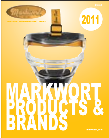
2011M Markwort Products & Brands 2011M September 2010 88 Pages