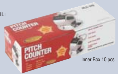
Inner Box 10 pcs.