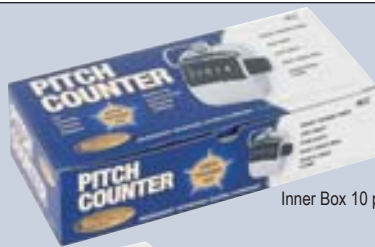
Inner Box 10 pcs.