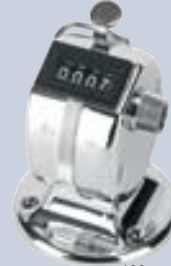
HLC-WS 100 pcs 23 lbs.