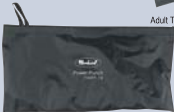
Adult Team Pack