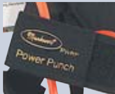
Close-up of embroidered arm strap