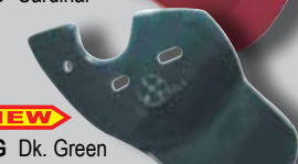
NEW DG Dk. Green