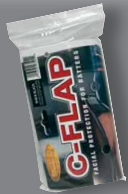
Plastic Bag-Smaller Retail Package w/Color Illustration