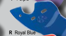
R Royal Blue