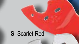
S Scarlet Red