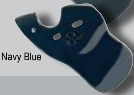
N Navy Blue