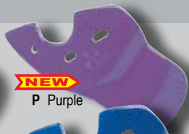
NEW P Purple