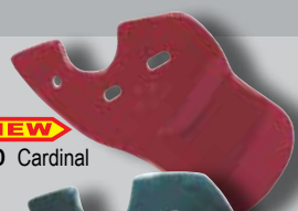
NEW CD Cardinal