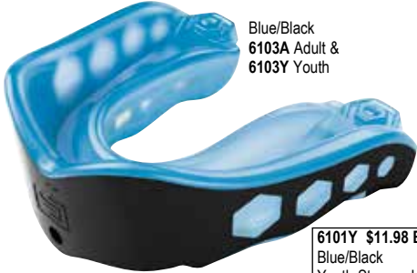
Blue/Black 6103A Adult & 6103Y Youth

6101Y $11.98 EA Blue/Black Youth Strapped