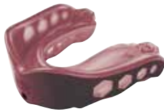
6183A & 6183Y Maroon