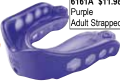
6163A & 6163Y Purple