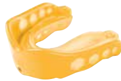
6173A & 6173Y Yellow