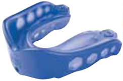
6153A & 6153Y Royal Blue