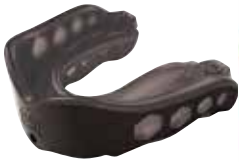
6113A & 6113Y Black

GEL MAX CONVERTIBLE ..... $17.00 EA Triple layer design with integrated breathing channels. Gel-fit Liner™ custom molds to teeth for a tight, comfortable fit. Universal easy fit for all ages. Exoskeletal heavy duty rubber shock frame with integrated jaw pads. Convertible tether. Use strapped or strapless.