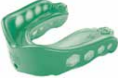
6123A & 6123Y Green