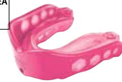
6193A & 6193Y Pink