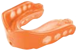
6133A & 6133Y Orange