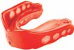
6143A & 6143Y Red